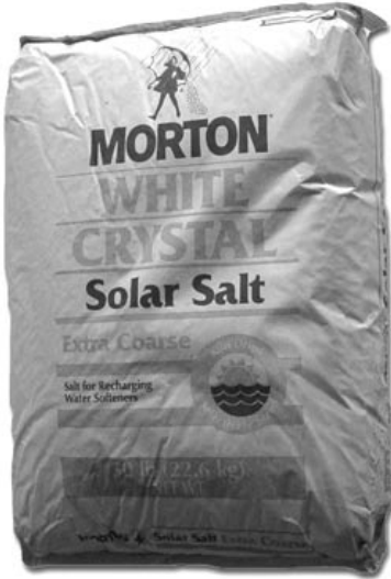
Morton White Crystal Solar Salt

Lbs. 50lb. bags Course 50lb. bags Extra Course